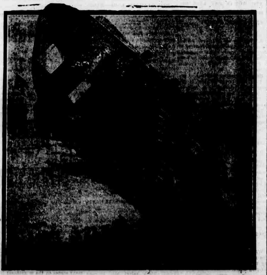
Britannia is the British tank which is to go on a long recruiting tour thru the south and later thru the Middle West. It is here shown when it almost overturned in action at Camp Upton. There it has been used to demonstrate to American soldiers the uses of such instruments of war. The driver here shot the trench before him at the wrong angle, and the tank tipped on one corner. But it was a good demonstration of the trials and tribulations of operating a tank on the battle line. The tank is to go thru Richmond, Augusta, Atlanta, Birmingham, Mobile, New Orleans, Memphis and Louisville during the winter, and in the wet season it will move north.