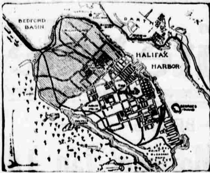
The star in the narrow in the above map shows where the Mont Blanc blew up. The shaded part of the map shows that part of the city which was devastated by the explosion and the fires which followed.