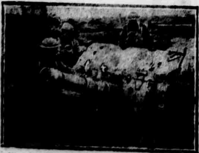
A German 5.9 Gun Captured Near Poughkeepsie

This well protected German 5.9 Haig's cannon. The gun was captured and its crew near Mouthout by the Coldstream Guards. One of the crew was unable to withstand the man in the group was a British survivor of the from Field Marshal volunteer from the United States.