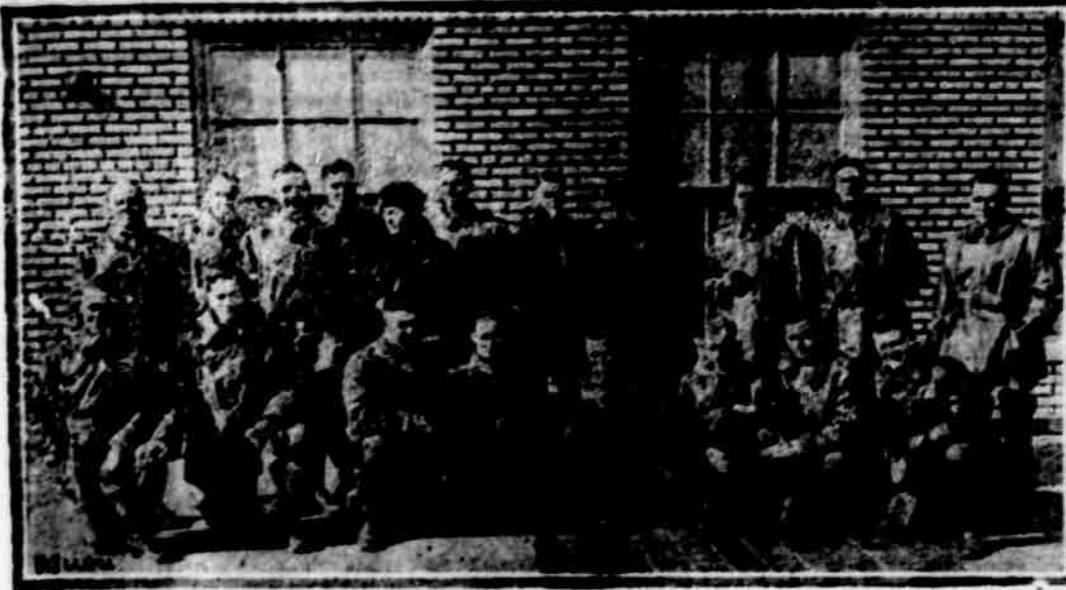
Seventeen American aviators, who are grateful for their outfits donated by the aviation section of the National Special Aid Society.