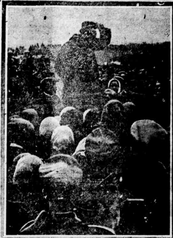
Leon Trotzky, new revolutionary leader along with Nikola Lenin, and now foreign minister of Russia, with Lenin as premier, is here shown talking to crowds on the streets of Petrograd. Trotzky was a reporter for $12 a week on a Jewish daily newspaper in New York City four months ago.