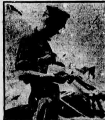
NEWS FROM HOME

Mary Pickford in "Rebecca of Sunnybrook Farm." Never has a star appeared in a more desirable, as well as suitable characterization. Known throughout the land as "America's Sweetheart," Mary is just the person to portray the national type of "Rebecca," the little country girl who fought her battles alone and traveled a particularly rough road leading to her womanhood. The many charms and quaint situations of "Rebecca of Sunnybrook Farm" are brought out in the Art craft picture as only Mary Pickford can. The photoplay will appear at the Star commencing tonight.