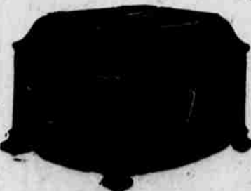
$57.50 NEW VICTROLA