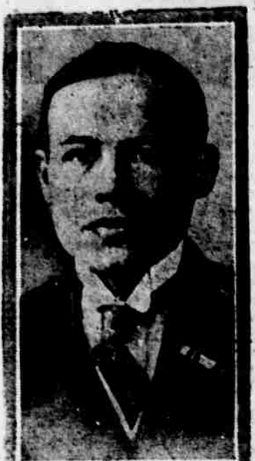
SERGEANT ARTHUR GUY EMPEY

Sergeant Arthur Guy Empey of the British army, author of the book "Over the Top," which has attracted such wide attention, is now in the United States lecturing. He did much hard work also helping the Liberty Loan campaign.