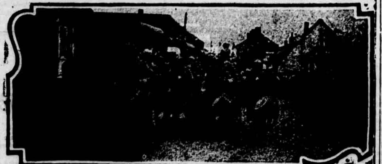
The Red Cross in France, with Aid of the American Red Cross, Has Helped Send These Departing Men Back to the Trenches with Smiling Hearts.