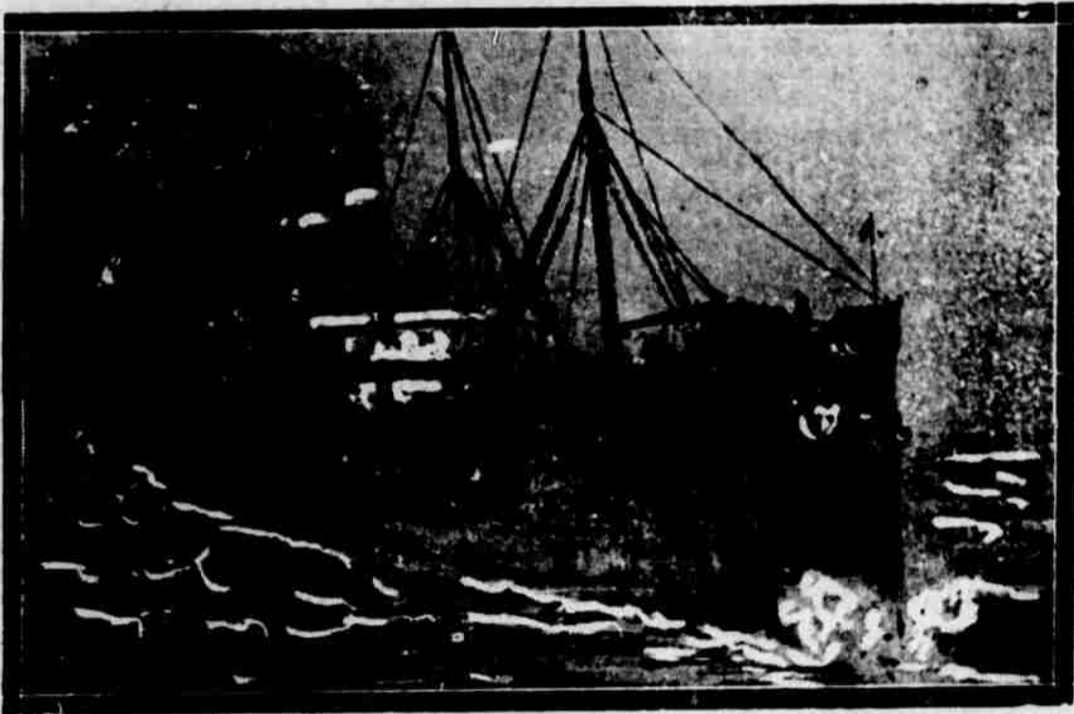
The American line steamship Kronland on her last trip to Great Britain sank a German submarine by ramming her. Other American vessels which have come in with reports of having sunk submarines told of firing on them. In this case the vessel turned on the U-boat and ran over her, smashing her to bits.