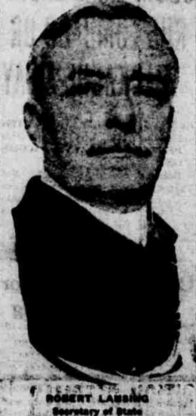
ROBERT LANSING Secretary of State

WASHINGTON, D. C., Dec. 21.—The ambassadors representing Great Britain, Japan, Germany, Italy, Bulgaria, Persia and Turkey are closeted with Secretary of State Lansing this afternoon, following announcement of the note sent to all belligerents by this nation.