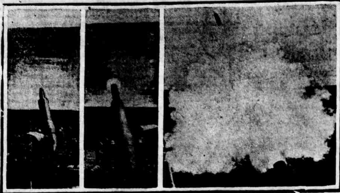
This is a remarkable piece of photography, actually showing a twelve-inch shell leaving a mortar at Fortress Monroe. The first picture shows the shell about out of the mouth of the mortar. The second shows it clear, and the third has caught it in the air beyond the burst of smoke. The camera was operated with the same electric button which set off the shot.

scenic and sportsman's attractions, including Crater Lake, cannot be excelled in the world. The Oregon, California & Eastern project provides lines from Bend to Klamath Falls, Lakeview and Crane, with short branches to Burns, Bonanza and The Narrows. The total mileage is 424 miles. The lines to be connected and, if they so desire, to be afforded the change from branches to more or less important through lines are the Oregon Trunk (Hill line) and the Oregon-Washington Railroad and Navigation company (Harriman line) at Bend, the Union Pacific at Crane, the Southern Pacific at Klamath Falls and the Nevada, California & Oregon at Lakeview. The total cost of the Oregon, California & Eastern, owing to absence of high mountain ranges, large streams or other engineering difficulties, will be only $15,000 per mile, or about $6,000,000 for the entire system, a considerable portion of which, with right of way and terminals, already has been pledged by the communities interested. Climatic conditions favor economical operations. — Portland Oregonian.