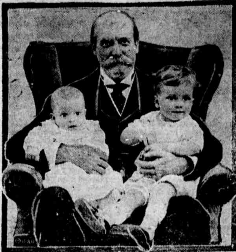
CHARLES E. HUGHES AND GRANDCHILDREN