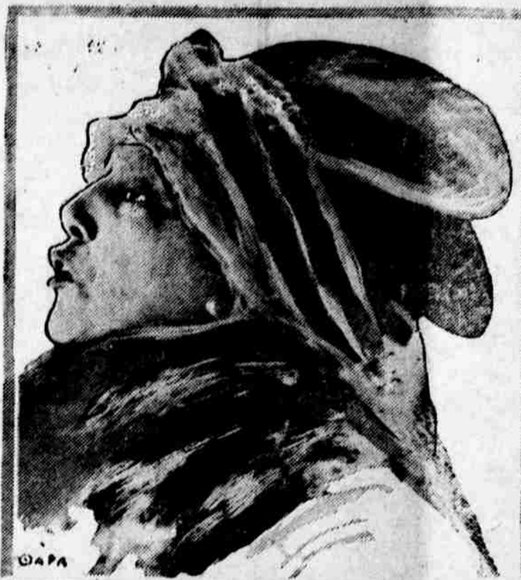
MME. SARAH BERNHARDT

Sarah Bernhardt, the great French actress, positively refused to pose for the photographers when she stepped from the liner Espagne at the New York pier, Wednesday. She had just gone through the sea off Nantucket, believed to be in control of U-53, which has already sunk six steamers.