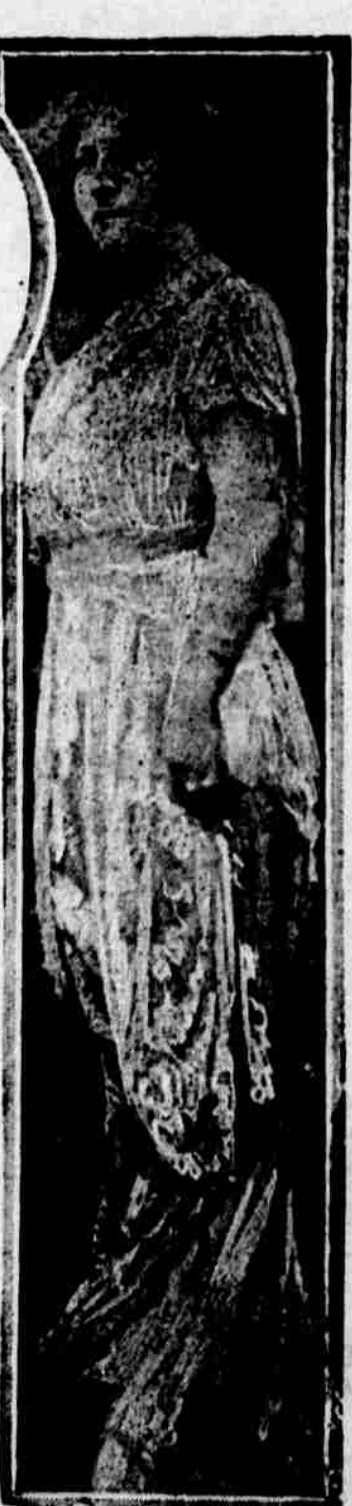
Mme. Gadski (Mrs. Hans Tauscher)

NEW VEILS AND VEILINGS GERTRUDE & CO. Sixth and Main Sts.