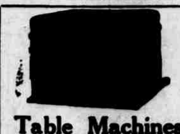
Table Machines In stock as Christmas Presents, the $15, 885 and $50 styles. Up

The Sunset Grocery has a fine line of Xmas candies, fruits and cigars.