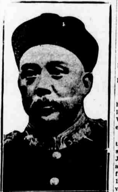
Yuan Shi Kai

"The nation that refused recognition to those who overthrew President Diaz of Mexico, or those who assassinated President Madero," the letter said, "cannot, in justice, or sincerity, recognize in China the traitors who