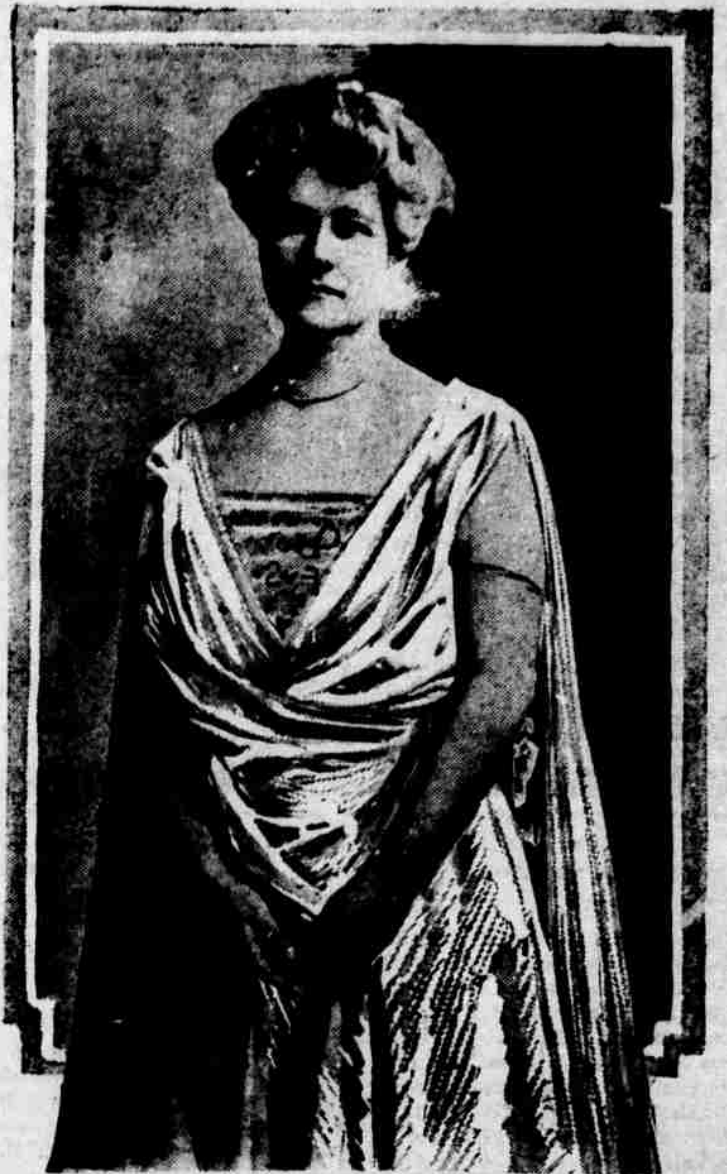
MRS. ROBERT LANSING, WIFE OF SECRETARY OF STATE

Grape juice, the Nebraska drink, State Bryan made a part of diplomatic etiquette when he took the office more than two years ago, has seen its last. Mrs. Lansing will permit any diplomat to drink it if he chooses, but she will not force it on him. Mrs. Lansing is the daughter of John W. Foster, the first among American diplomats and secretary of state in the cabinet of President Harrison. She has lived in Washington all her life, where she was brought up in diplomatic society. Not only is she one of the most popular women in society in Washington, but she is the handsomest matron it contains.