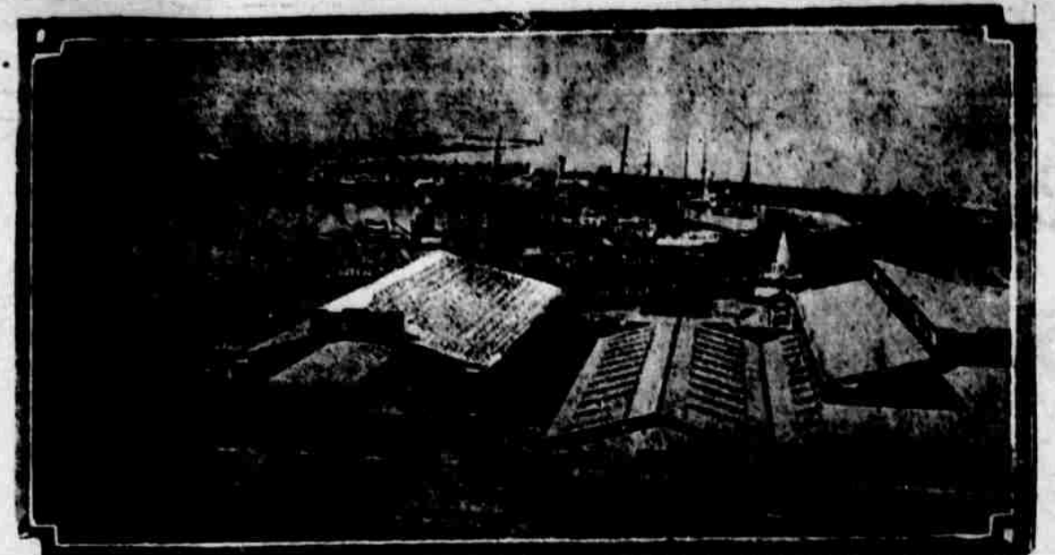
A great number of transport ships laden with ammunition and newly equipped Russian troops are here awaiting orders to move against the Bulgarians.