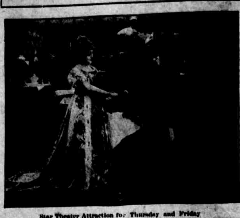
Star Theater Attraction for Thursday and Friday