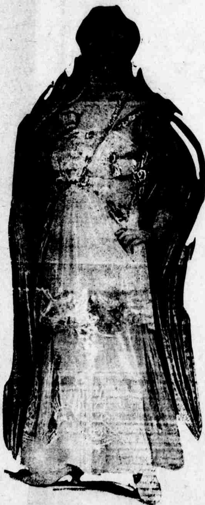
"Made in America"

This gown worn by a well known society woman, was made in America on plans of an American designer. She wore it recently at a social function at her home, and most of the women present who were good judges of clothes were taken with the gown of their hostess. In selecting the decorations for her entertainment she first considered her own gowning, including the suitability of the certain colors to herself. Her choice fell upon yellow, and with yellow she arranged her drawing rooms, having flowers of yellow with backgrounds of green ferns and foliage, and here and there a cluster of white flowers entered into the arrangement.