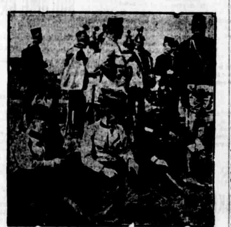
These are the Austrian officers who will conduct the war against Serbia in the field and against Russia if the czar interferes. The photograph was taken at recent manoeuvres of an army corps.