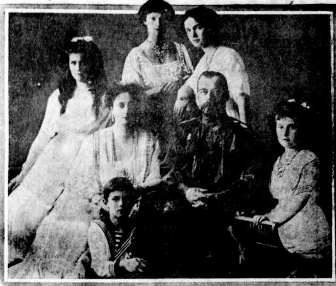
From left to right—Grand Duchess Anastasia, Grand Duchess Olga, Grand Duchess Tatjana, Grand Duchess Marie. Bottom—Czarevitch.

Another attempt to kill Czar Nicholas of Russia and all his family has just been made. The czar and his family were returning to their summer palace from a visit to King Charles of Rumania at Kustendje by train. A special went ahead as protection. A bomb placed on the