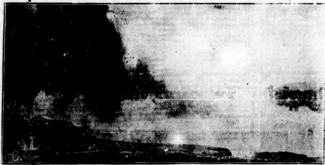
Twenty tons of dynamite were used by the engineers of the Panama canal to open it to the waters of the Pacific Ocean. They shot a blast on the dyke below Milaflores to tear out the dam which had kept the ocean waters out.