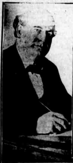
William Jennings Bryan

United Press Service WASHINGTON, D. C., Sept. 20.—Secretary of State Bryan today declared that he intends to continue lecturing just as long as he wishes to.