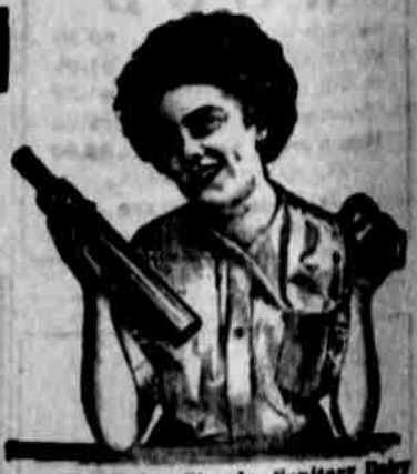
The light, simple, sanitary Sharples Dairy Tubular Cream Separator.

You'd consider your wife lacked spunk, if she didn't kick at washing the ten feet of rattling discs, from a single common "bucket bowl" cream separator, when she might as well be washing the simple, light cleaned in-a-minute Dairy Tubular Bowl.