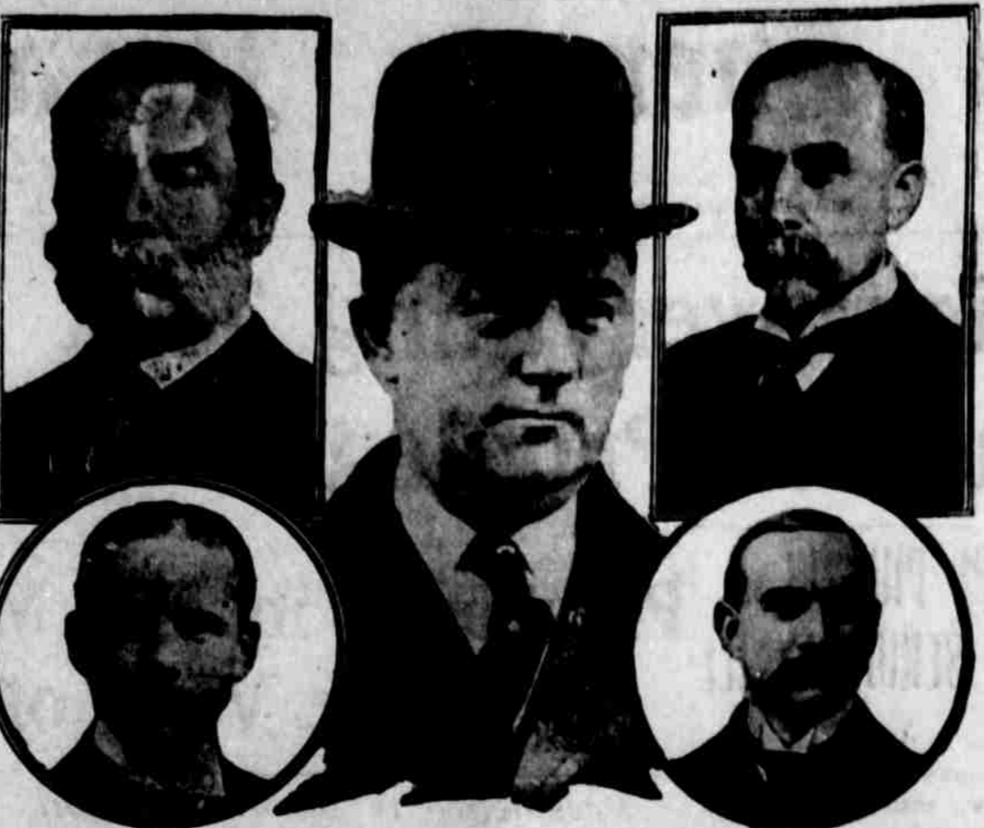
From left to right (top row)—George F. Baker, Henry P. Davidson, A. Barton Hepburn. Lower row—Thomas W. Lamont, James Stillman.

While it is not expected on Wall street nor in financial circles anywhere else that any one man will rise to take the place of Morgan, the man who will wield most of the power he has left will be Henry P. Davidson, one of the eleven partners in J. P. Morgan & Co. Davidson has been in practical charge of the firm for three years, and during that time has been