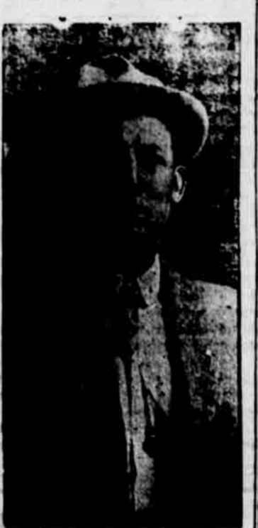
That Can Save You