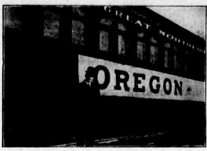
The above picture shows Governor West while he was east on the Governor's Special. The picture was taken at Baltimore,