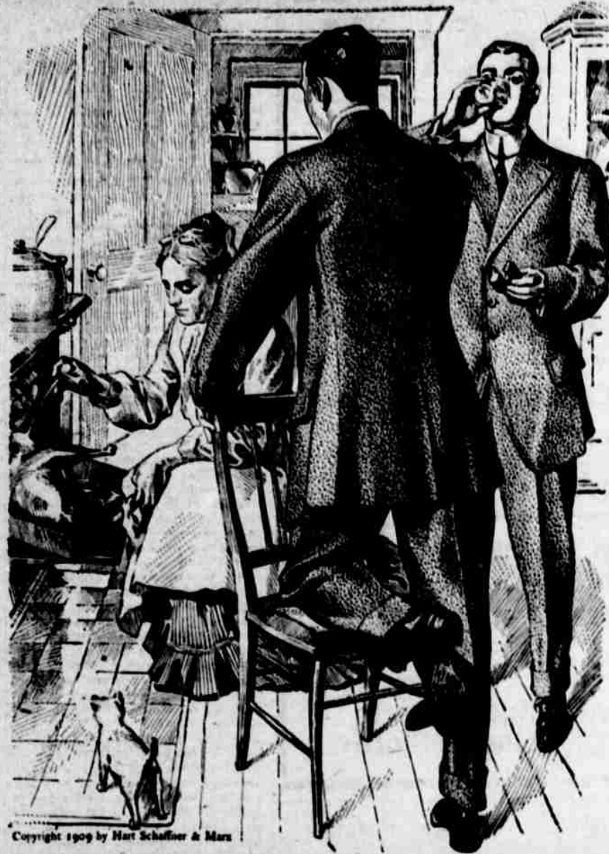
Copyright 1909 by Hart Schaffner & Marx

THURSDAY, November the 25th, is 288 years since our forefathers in the historical Plymouth Colony celebrated the first Thanksgiving Day