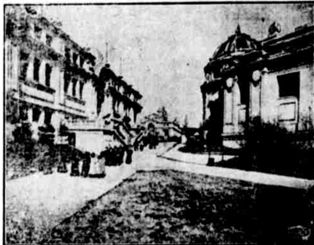
A SUNNY DAY ON YUKON AVENUE, A-Y-P. EXPOSITION, SEATTLE.

The generation of electricity by aeromotors or "wind turbines," as they call them, is making great progress in England, as shown by an exhibit at the seventieth annual show of the Royal Agricultural Society at Gloucester. The exhibit included a 24-foot turbine on a 60-foot steel tower driving a variable-speed generator, with considerable excess storage-battery capacity to provide for calm. Current was supplied for an electric grill, kettles, irons and fans, as well as a butter churn, a cream separator, circular saw and a deep-well pump. A division of the storage battery into two parts it is possible to use 50-volt current for driving the machines and 25-volt current for lighting, the latter permitting the use of metal filament lamps.