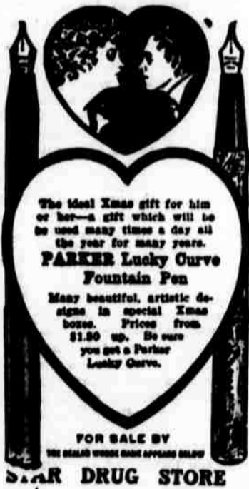
FOR SALE BY THE GREAT WHITE BIRD OFFICE BUILDING STAR DRUG STORE

To secure gifts that will please, just visit our store and see our large and varied stock. The stock is now complete; make early selections.