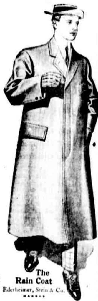
The Rain Coat Ederheimer, Stein & Co. MAKERS