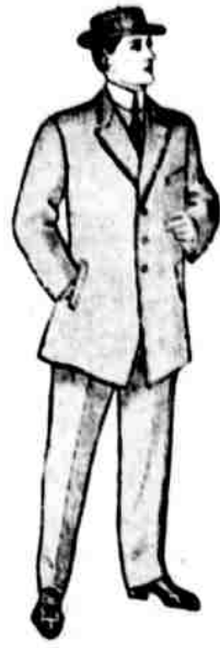
Three-Button Novelty Sack, No. 516.

you and separate you from the throng who carry around uncomfortable and unsatisfactory "ready-to-wear" ready-made clothing, are, as a matter of fact,