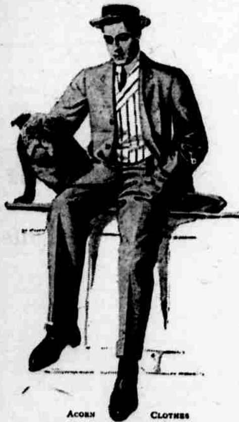
ACORN CLOTHES Leopold, Solomon and Eisendrath Chicago

Beginning April 15th and Lasting Until May 1st