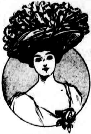
IN MULBERRY TINTS

A Picture Hat in Monochrome. The graceful hat illustrated is in a warm tint of mulberry silk trimmed with satin ribbons, dyed tambour lace and tulle, all in the same shade of mulberry. These one-tone effects are