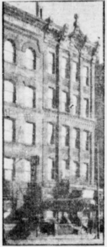
MECCA FOR TOURISTS. The Dumas Hotel, 135th St., New York City, where visitors from all over the country make their headquarters.