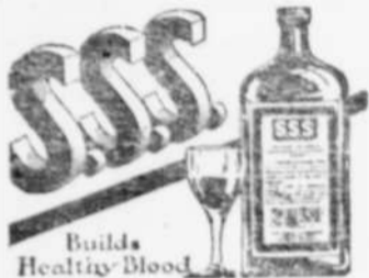
Builds Healthy Blood