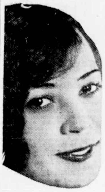
A light, soft skin makes you ATTRACTIVE