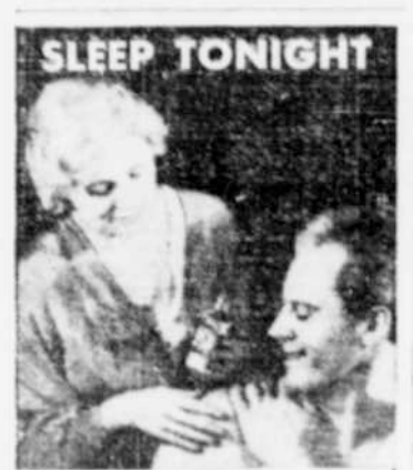
thry glad for had this bettle of

"I'm twice as glad! It certainly did the teak the last time."