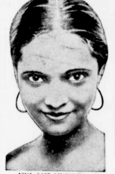
NINA MAE MCKINNEY