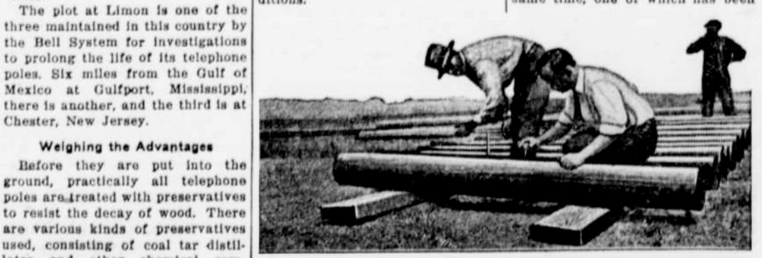
This borer will bring out a solid plug of wood which shows how far the creosote has penetrated the pole.

A very much extended lease on usual telephone pole. They are, in plots help to decide. There is also life is given to telephone poles by fact, telephone poles; not carrying the matter of the different woods the use of the preservatives. The cross-arms and supporting wires, for telephone poles. Southern yel- engineers at the test plot can easily but undergoing weathering tests as low pine, chestnut, cedar, and lodge- demonstrate this by showing the part of the laboratory research pro- pole pine are all used, and each has difference in poles, both cut from gram of Bell Telephone Labora- its advantages under certain con- the same log and set out at the same time, one of which has been