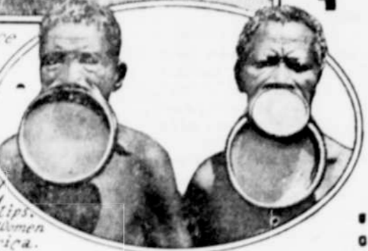
Where Beauty is Judged by Width of the Lips, Disk-Lipped Women of Central Africa