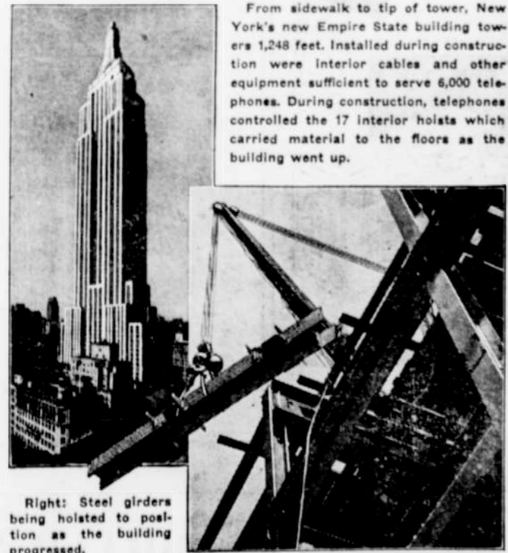
Right: Steel girders being hoisted to position as the building progressed.