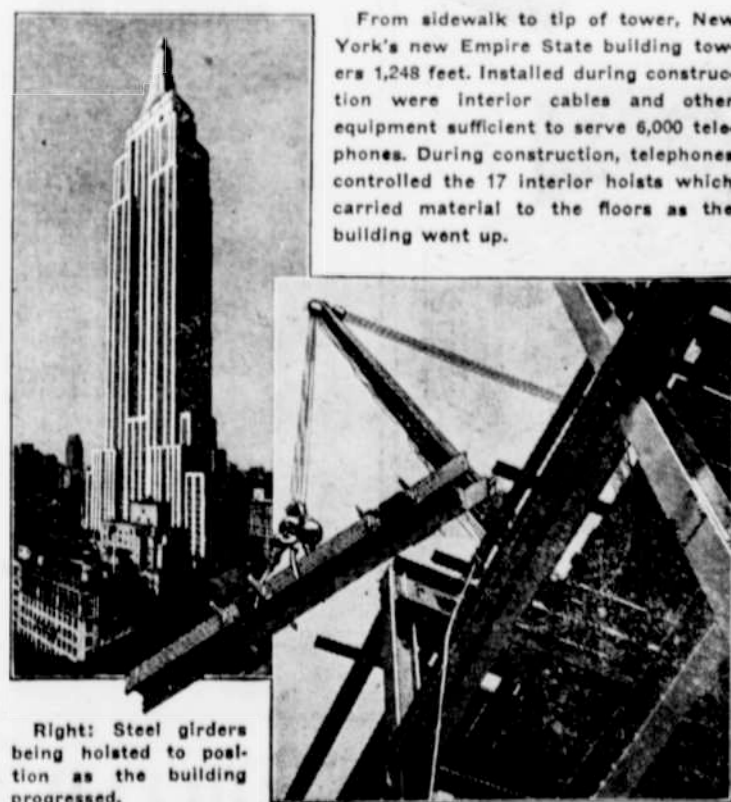
Right: Steel girders being hoisted to position as the building progressed.

From sidewalk to tip of tower, New York's new Empire State building towers 1,248 feet. Installed during construction were interior cables and other equipment sufficient to serve 6,000 telephones.