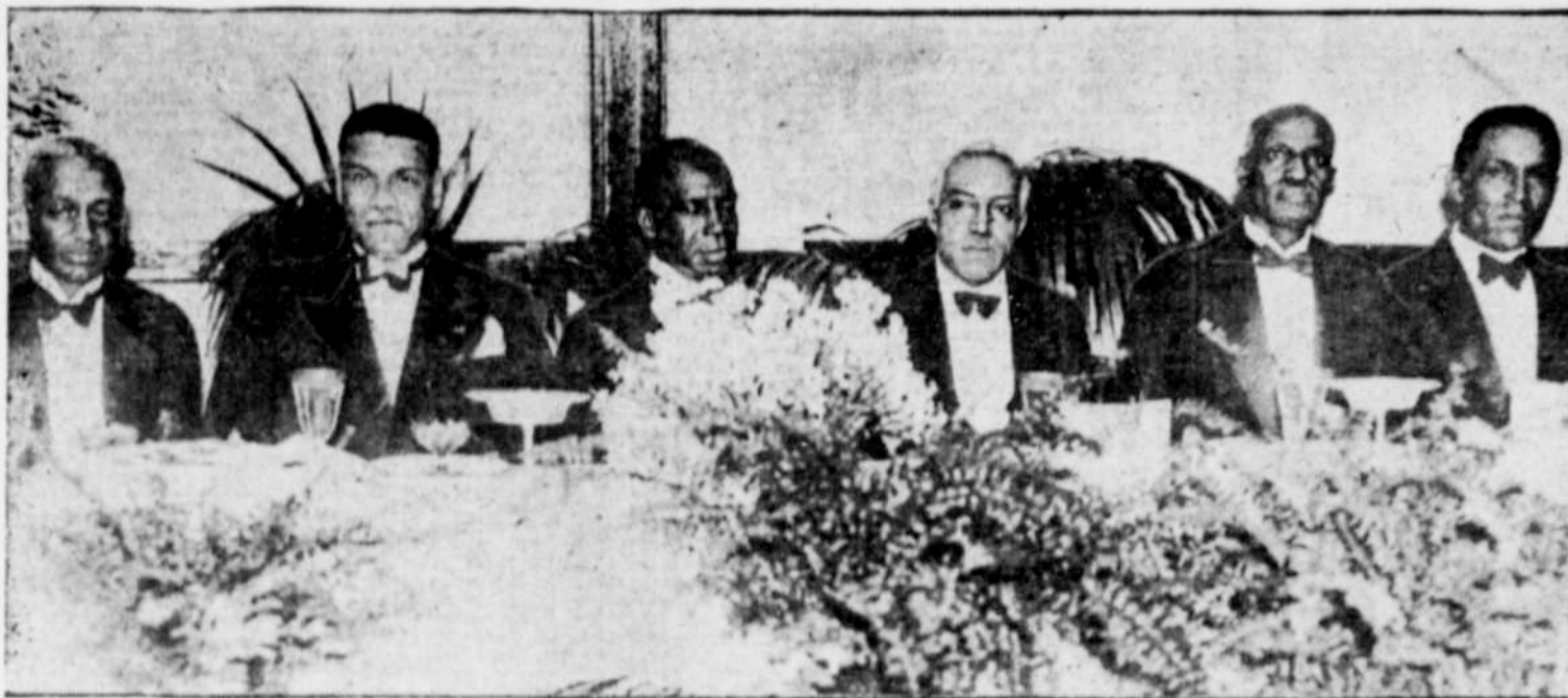
HAITIAN MINISTER TO U.S., GUEST SPEAKER AT PRINCIPALS' ASSOCIATION ANNUAL DINNER—The speakers' table at the Y.M.C.A.