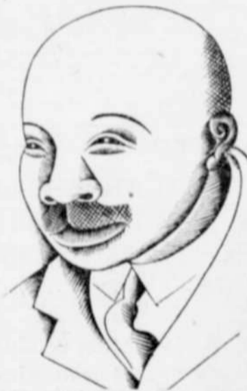
Covarrubias, famous Mexican cartoonist, drew this to represent W. C. Handy.

man who is constantly alert. He likes to have new irons in the fire; likes to have new things to interest him. So far as his mentality is concerned he is capable of thinking just about as fast as any man can think. He is very matter-of-fact, and shows a distinct strain of literary ability.