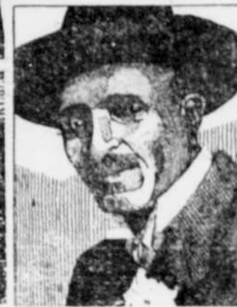
PROF. GEORGE W. CARVER