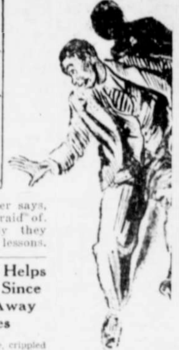
Pierson Suspect is Arrested Again