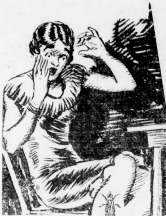
"Some women are afraid of any kind of insect."