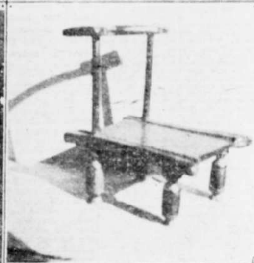
Top Right—Coffee grinder and different varieties of basket containers made by interior Africans. Above, a King's chair from Liberia. It is used by the heads of tribes, as a chair denoting dignity.

And she may get such a diverse order filled promptly by the ice company, according to the National Association of Ice Industries.