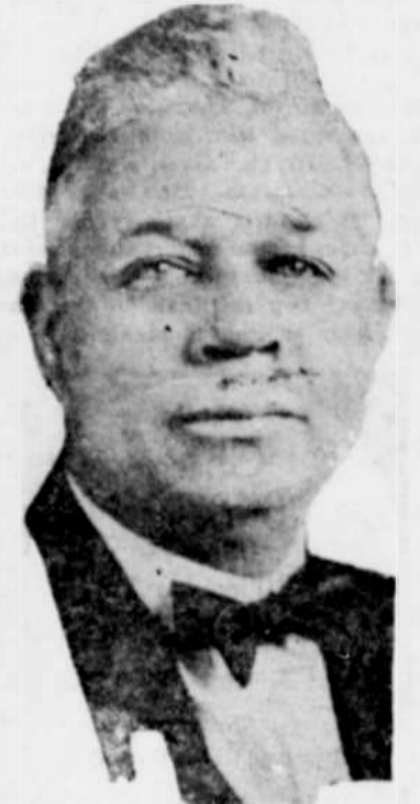
(See story on page 1)