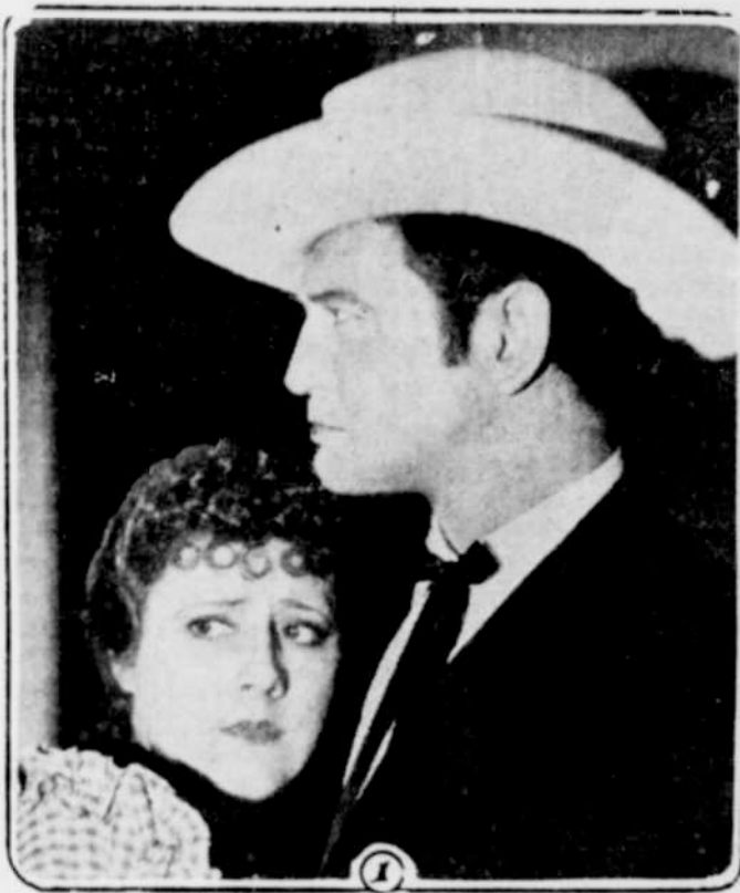
IRENE DUNNE and RICHARD DIX play leading role