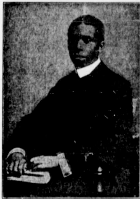
PAUL LAURENCE DUNBAR

Another great star whose birthday was observed this month. Dunbar is to America "Bobby Burns."