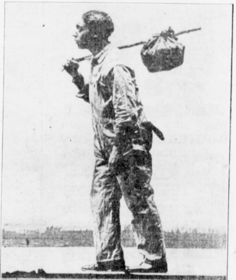
Cain—on the road to Nod Country. Everyone knows the story of Cain and Abel. In “The Green Pastures” it is portrayed with unequalled dramatic strength. Picturesque scenes form a fitting and colorful background to the action surrounding this portion of the play. It adds to the spell binding appeal of Broadway's stage wonder.