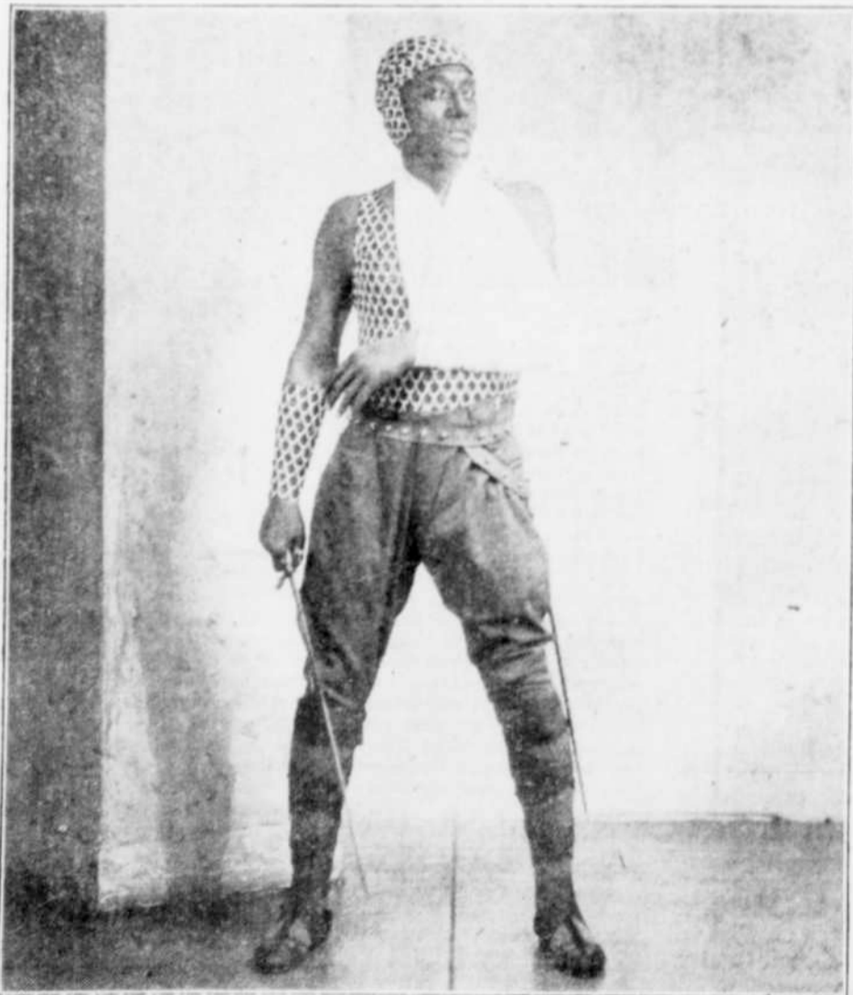
Daniel Haynes, as Gabriel in “The Green Pastures.” It has been said that Mr. Haynes's acting in this part is the best of his career. His acting in “Hallelujah,” won unstinted praise and possibly crowned him one of the best movie actors in the race. His versatility and ability of the first order is now unquestionable. From insurance salesman choir singer and other small roles he has now become one of the most important personages on the American stage.

Instead of milk and honey, “The Green Pastures” indicates that the Heavenly streets will be lined with fresh fish prepared better than any earthly creature has ever tasted. From the looks of the above fish-fry scene the milk and honey isn't even missed. This is a characteristic scene taken from one of the striking and sensational plays within the last decade. Seats are sold out four and five weeks in advance, while ticket scalpers get as much as one hundred dollars for a single seat. “The Green Pastures” should be especially significant to Negroes since it has an all-colored cast. The above group of angels with protruding wings form one of the most realistic situations in the entire play.