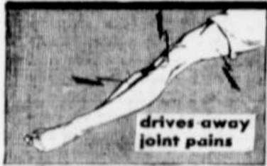
drives away joint pains

was lost. The mountains over which he and his dog were passing seemed to have an effect on his sense of