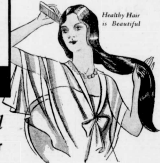
Healthy Hair is Beautiful