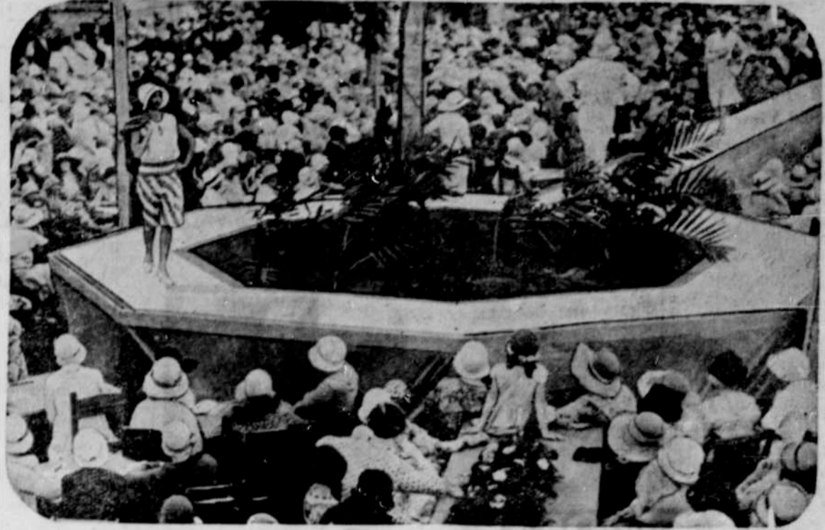
General view of the midwinter fashion show held in the gardens of one of the great hotels in Miami Beach, Fla. The visitors from the North had the opportunity to see the styles for next summer.