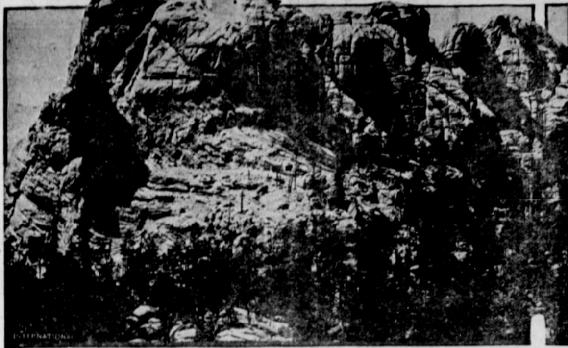
This is Rushmore mountain in the Black Hills of South Dakota, on the surface of which will be carved the 500-word history of the United States which Calvin Coolidge is writing. The mountain is being made into a national memorial bearing colossal heads of Washington, Jefferson, Lincoln and Roosevelt designed by Gutzon Borglum.