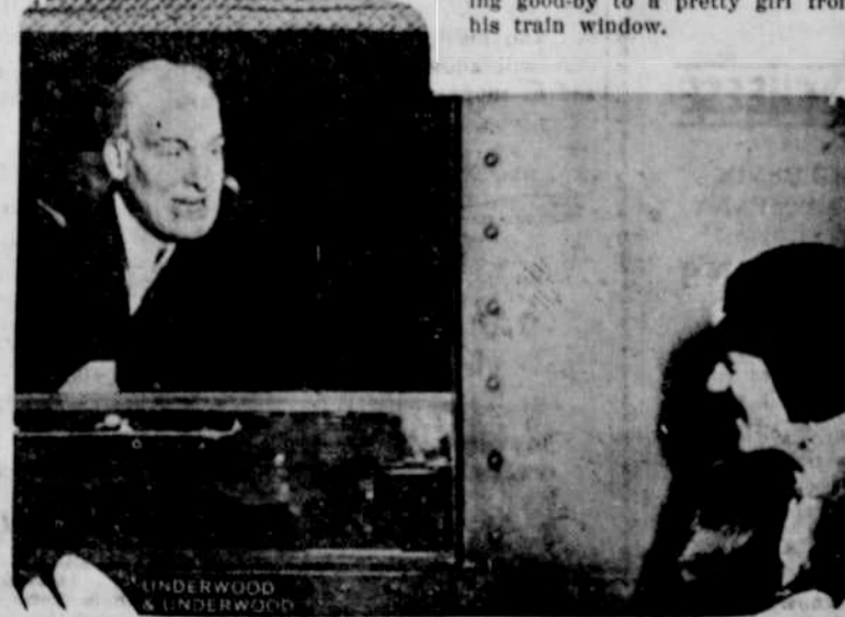
When Jacob Gould Schurman, retiring American ambassador to Germany, took his departure from Berlin, a great throng gathered at the station to bid him farewell. He is here seen saying good-by to a pretty girl from his train window.