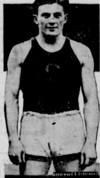
Ray Barbuti, the only winner of a flat race for the United States in the 1928 Olympic games, who has just been restored to good standing by the A. A. U.